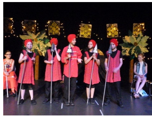
Scenes from 'Ali Baba & the Bongo Bandits', performed at the Minster School theatre