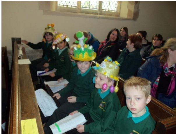
Easter celebrations in St Swithin's Church, Kirklington.

The school is not affiliated to any particular denomination, although services are usually held at St. Swithin's Church for Harvest, Christmas and Easter, and children are invited to join in with prayers or have time for reflection during assemblies.