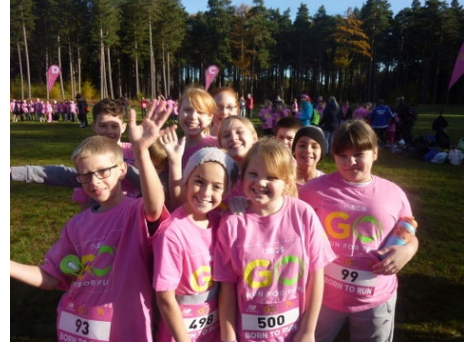
Trying wheelchair basketball, medal winners at sports day (mixed age teams) and Sherwood Pines fun run