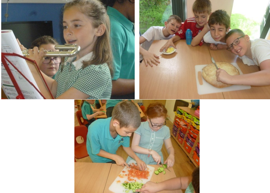
The school places high importance on the use of cross curricular themes.

There are six qualified teachers on the staff, three of whom are full time, and three who are part time. There are also six Teaching Assistants (TAs), four full time and two part time. Our teaching assistants are deployed across the school as required to support teaching staff with their classes or to work on intervention with individual pupils or small groups.