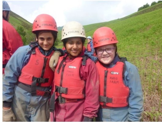
Other enrichment activities include music, drama, outdoor pursuits and regular visits linked with topics