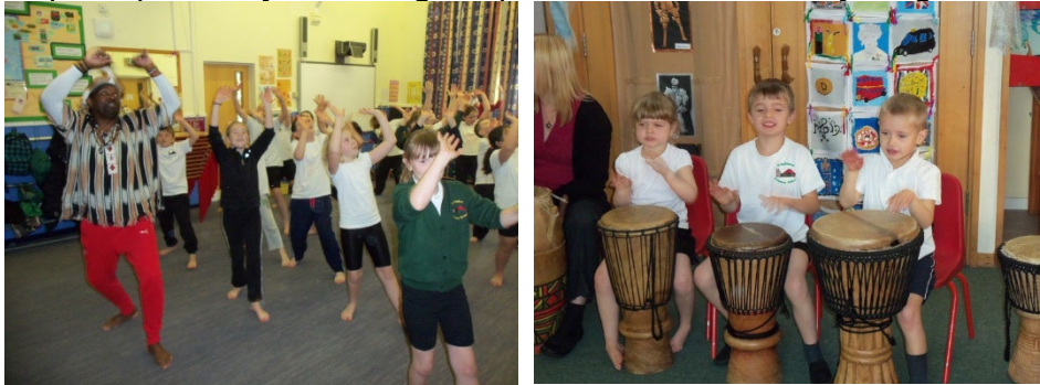
African dance and drumming workshops

Our pupils respond positively to our high expectations of them as young citizens.