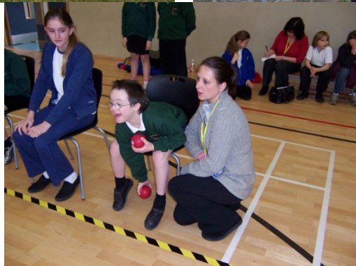
Playing together: mixed age teams on sports day and inclusion sports at the Minster School