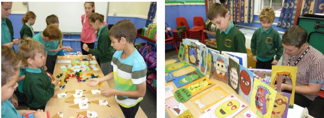
Creative learning projects – Enterprise is an annual event where pupils form their own companies to make and sell a product.

There is a member of staff (subject leader) responsible for each of the core curriculum subjects, Maths, English and Science. The remaining subjects are distributed between the staff ensuring full curriculum coverage in accordance with the National Curriculum 2014.