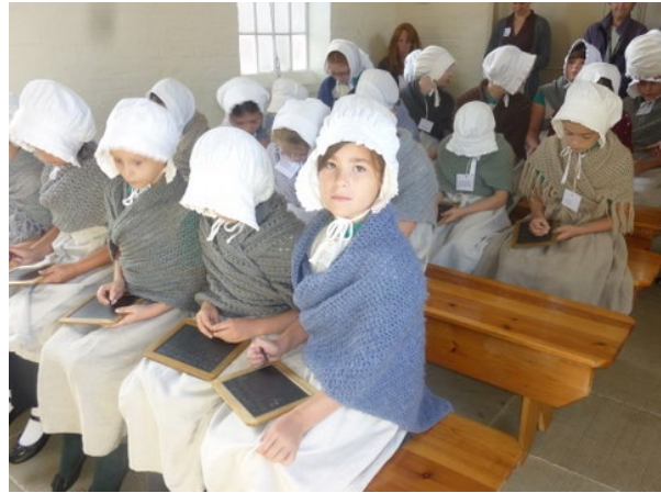
Southwell Workhouse visit