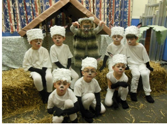
Shepherd's Delight (EYFS/KS1)