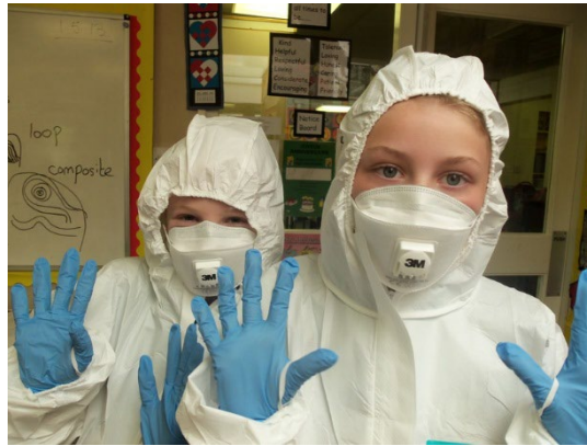
Children engaged in a CSI workshop

Staff are briefed about the current Nottinghamshire County Council arrangements for Child Protection. They are aware that the Head Teacher is the designated teacher with responsibility for Child Protection and that any concerns are to be raised with her as soon as they arise. There are also two deputy DSLs. Staff use CPOMS to record incidents and concerns which will be alerted to the relevant staff.