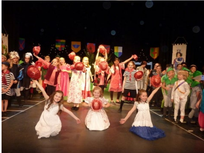
The finale of 'Robin & the Sherwood Hoodies'

We would also like parents to send children to school with a handkerchief or tissues.