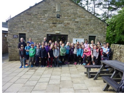
Making new friends for the future