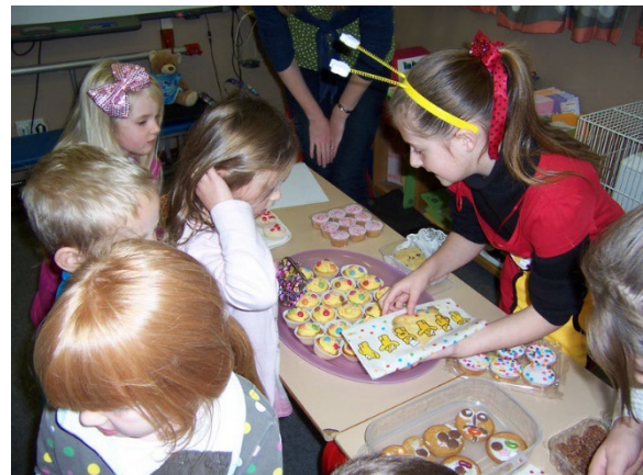
Fundraising in support of Children in Need and Comic Relief