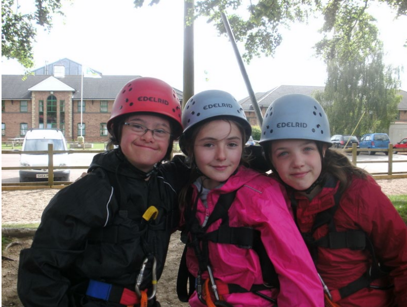
Learning together in a secure and caring environment

We have a policy for meeting the needs of pupils with special educational needs whether the child has a statement of special educational needs or not. The policy includes information about the school's processes and procedures. A copy of the full policy is available in school or on the school website.