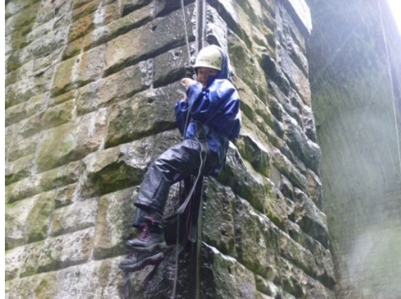
Children on residential visits in the Peak District (Hagg Farm)