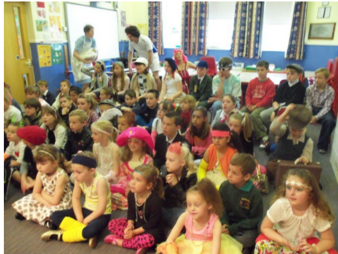
Children 'dressed for a decade' to celebrate our centenary

We run occasional sports clubs and forest school sessions during school holiday periods in partnership with Express Coaching and Moss to Canopy. Full time holiday care is available in Southwell or through some of the local day nurseries.