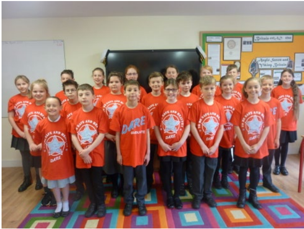
Our DARE graduates